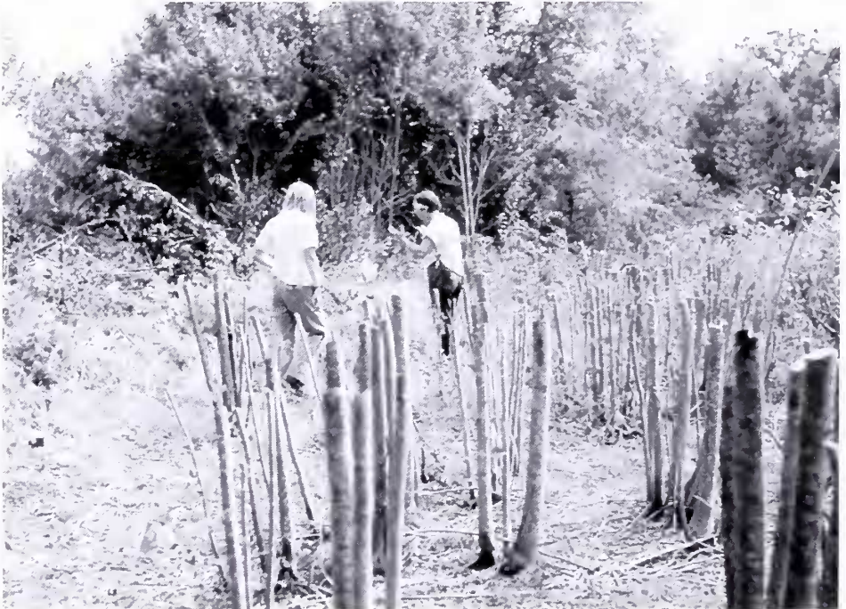
Figure 2: Discussing the effects of woody plant removal at a Sarracenia oreophila site.